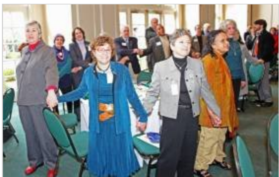
FAMA attendees singing We Shall Overcome